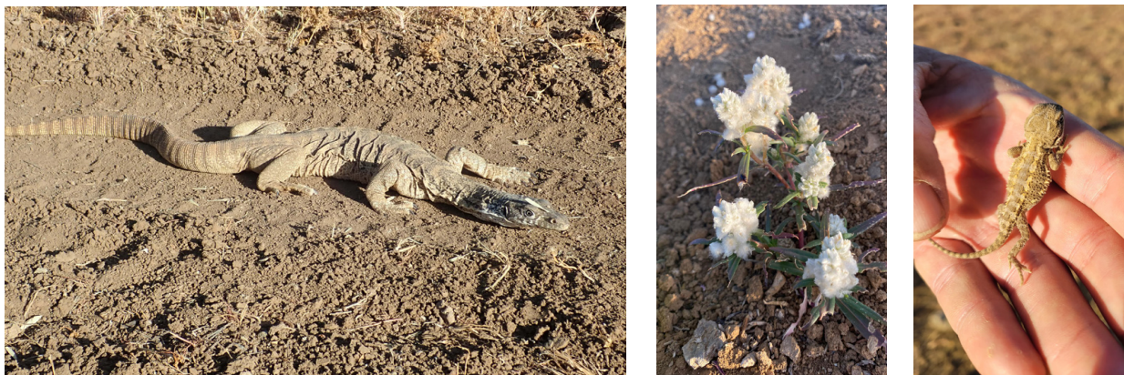
Figure 2: Ecology Field Survey Photos (Epic Environmental, 2022)