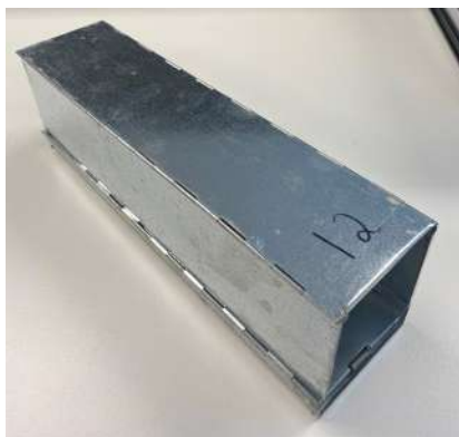
Plate 1: Type A Elliot Box Trap

Elliot traps and camera traps will be baited with a mixture of oats, peanut butter and sardines. Camera traps will be mounted on a stake or tree if available. All traps will be deployed for a total of five days and four nights. Traps will be checked daily each morning.