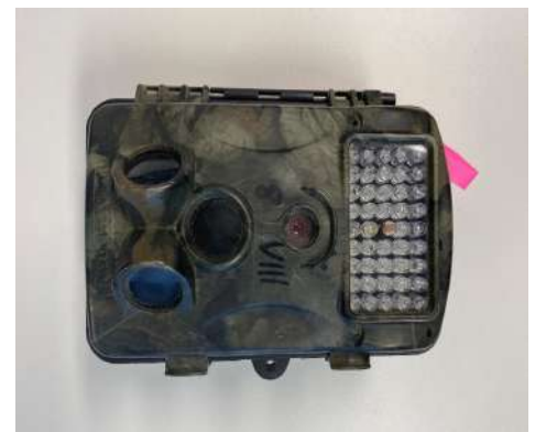
Plate 3: Camera Trap