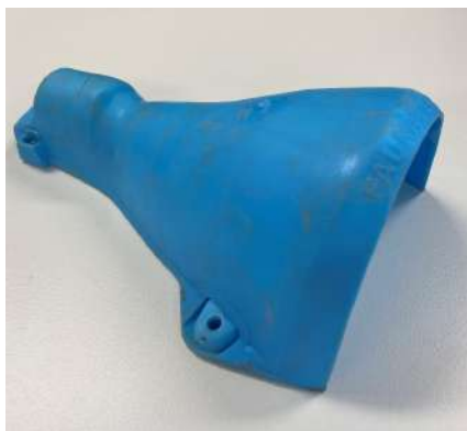
Plate 2: Funnel Trap