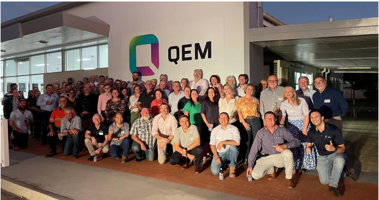
Image: Opening of QEM Office Premises in Julia Creek, 17 April 2023.

The opening of QEM's Julia Creek Office was attended by 150 MITEZ (Mount Isa to Townsville Economic Development Zone Inc.) members and industry leaders, local government councillors, state and federal government representatives, including Senator Susan McDonald, as well as the company's vanadium resource optimisation partners from the University of Queensland's Sustainable Minerals Institute.