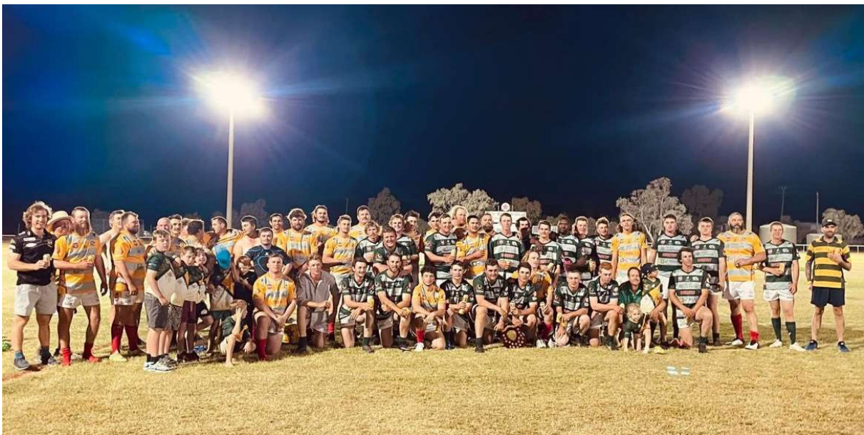
Image: Town v Country football at The Big Weekend, Julia Creek

A member of the QEM team is in Julia Creek approximately one week per month for the water monitoring program and various operational matters. A weekly email is distributed to landholders and community to update them on company progress, and a new community newsletter was distributed via the McKinlay Shire email Newsletter in early November.