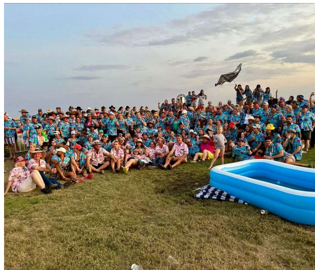
Images: The last horse racing meet of the 2023 season, known as the 'Beach Races', was a huge success with over 400 attendees dressed in QEM Hawaiian shirts.